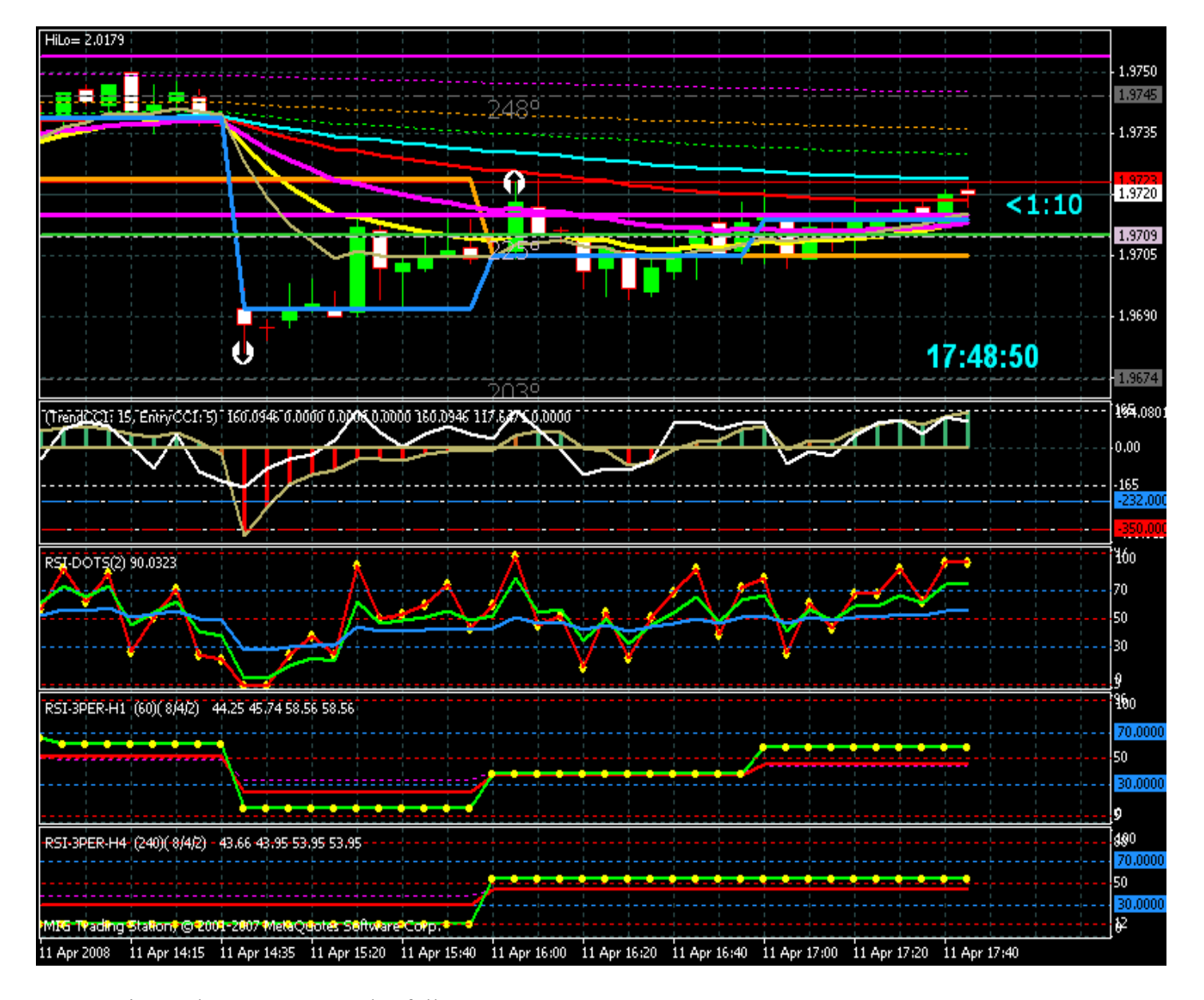
Two 5 minute chart entry examples follow