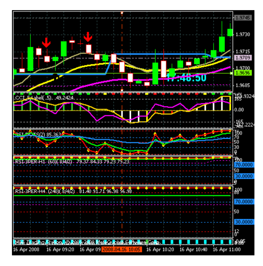
M5 chart – shows exit by rule CLOSE below 15EMA.